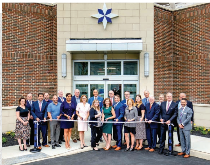
Ribbon-cutting at Seneca Street