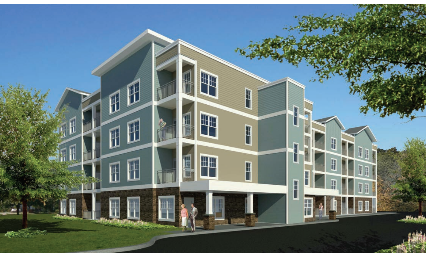
Liberty Square Apartments, Batavia