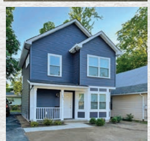
L2P Westside, Rochester