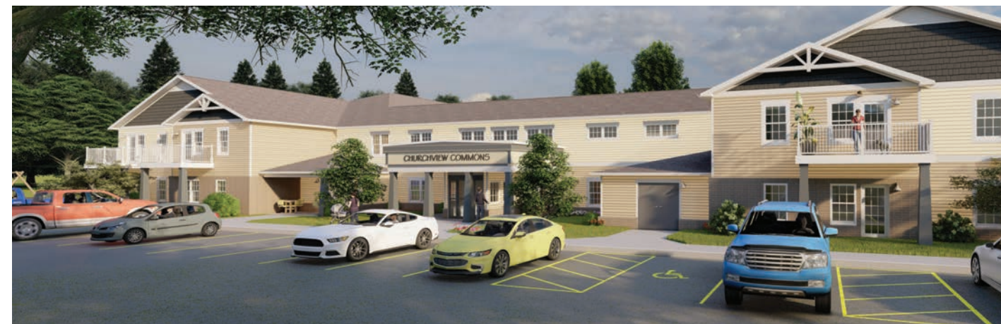
Five Star Bank is proud to not only provide construction financing for Churchview Commons, a new affordable housing development from PathStone Corporation, but to also help secure a $675,000 AHP grant for the development.