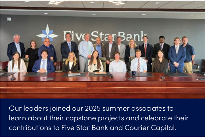
Our leaders joined our 2025 summer associates to learn about their capstone projects and celebrate their contributions to Five Star Bank and Courier Capital.