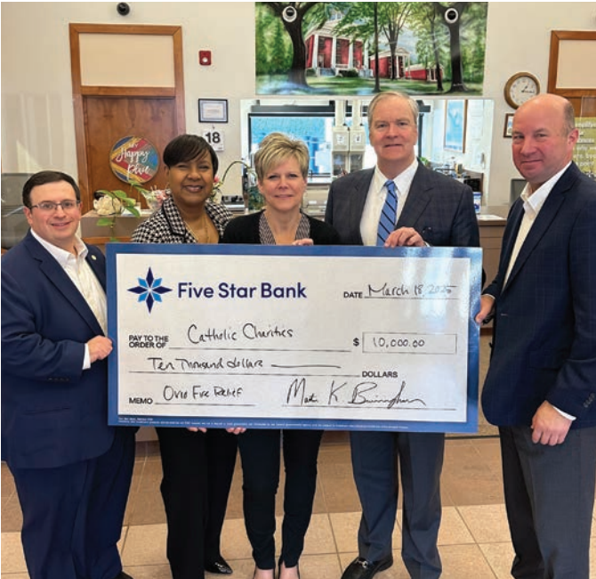
Five Star Bank leaders present a grant to Catholic Charities of the Finger Lakes.