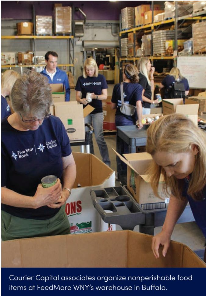
Courier Capital associates organize nonperishable food items at FeedMore WNY’s warehouse in Buffalo.

Members of our Human Resources team get ready to volunteer.