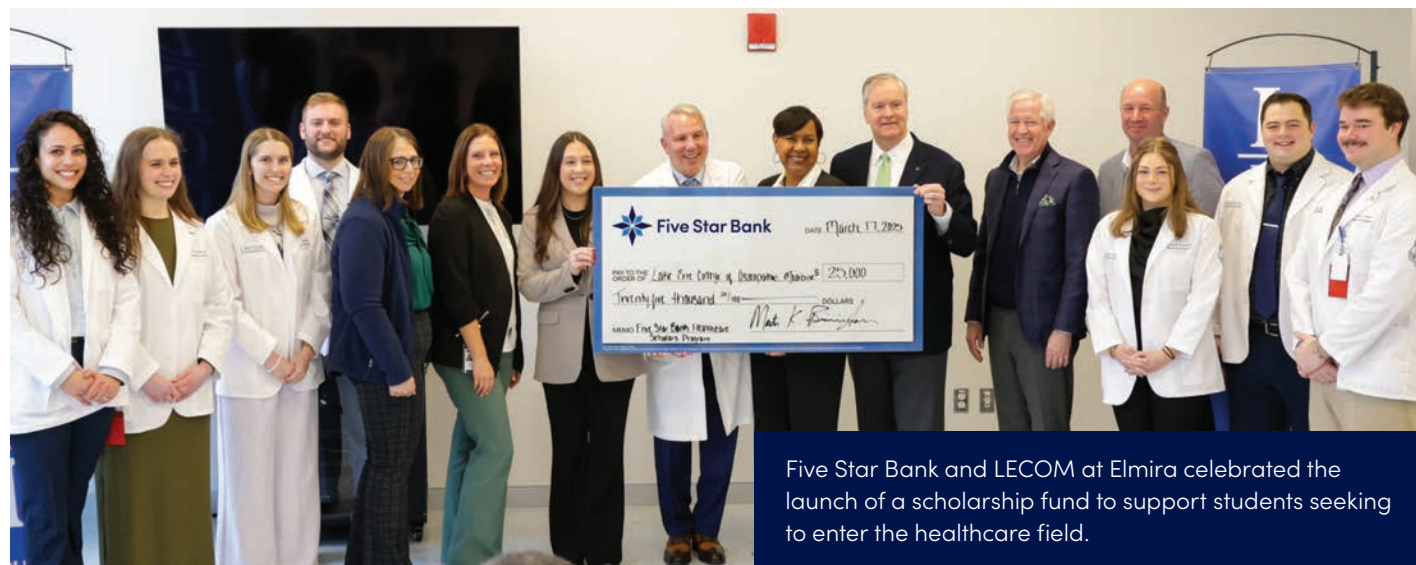
Five Star Bank and LECOM at Elmira celebrated the launch of a scholarship fund to support students seeking to enter the healthcare field.