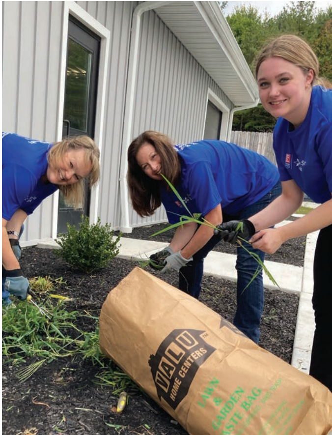
Five Star Bank associates help clean up the grounds at the Rural Outreach Center.

The mission of the Rural Outreach Center (ROC) is to break the cycle of rural poverty by accompanying people on their path to self-sufficiency. ROC serves families and individuals in rural southern Western New York who live below the Federal poverty level. ROC seeks to address the complex reality of poverty using a holistic, wraparound empowerment and accountable approach. Among the programs offered are play therapy and counseling services and the Dream Big! Summer Experience, which provides free summer care to eligible families. Five Star Bank’s grant funding supports clinical and care coordination services, play therapy, and summer camp expenses, which collectively serve more than 150 children annually.