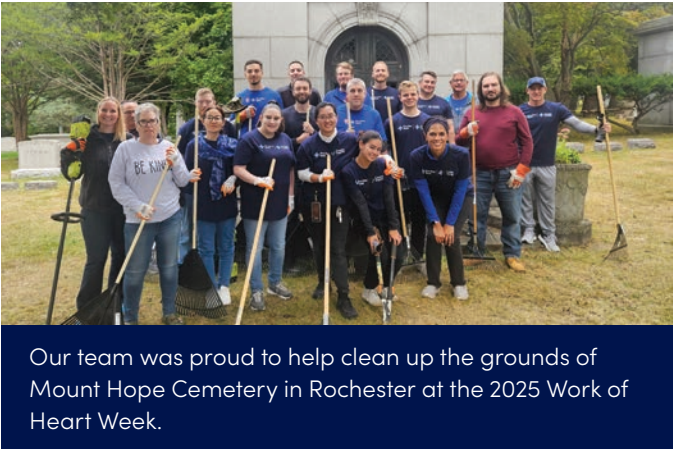
Our team was proud to help clean up the grounds of Mount Hope Cemetery in Rochester at the 2025 Work of Heart Week.