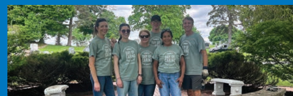
Our team cleans up Grandview Cemetery in Batavia.

Please visit Five-StarBank.com/CharitableGrants to learn more and to download our grant application for submission to KJGadley@five-starbank.com .