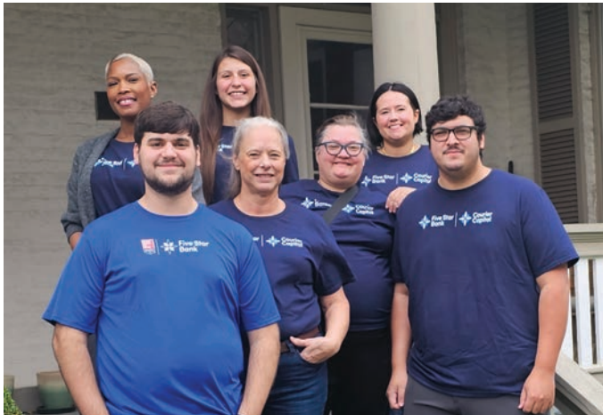
Five Star Bank associates volunteered for Family Promise of Ontario County during the Bank's 2025 Work of Heart Week.

The Center for Youth partners with young people to help them realize their full potential by creating opportunities, removing barriers, and promoting social justice. Five Star Bank's grant funding supports the New Beginnings House in the city of Rochester. This transitional living site is the only one of its kind in the area specifically for young men ages 16 to 22 facing trauma, poverty, homelessness and violence. The New Beginnings House accommodates six individuals at a time and, over the course of a year, can serve nearly two dozen young men, providing safe housing and supportive services during times of crisis. Funding for this program is critical, given changes in long-standing federal aid it relied upon.