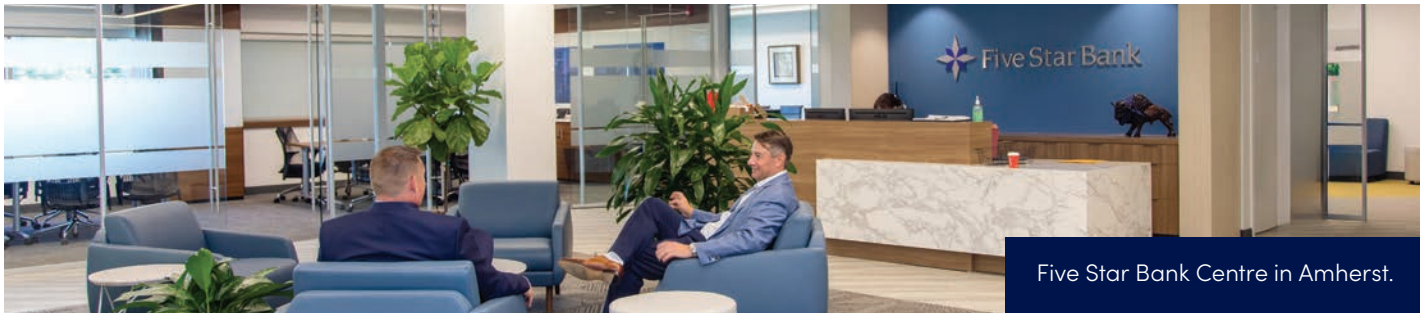
Five Star Bank Centre in Amherst.

We are proud to be a strong and growing presence in Western New York, operating 20 branches across Erie, Wyoming, Cattaraugus, Allegany, Genesee, and Orleans counties. Our local impact extends beyond that six-county footprint into neighboring Niagara and Chautauqua counties, which are within our Community Reinvestment Act (CRA) assessment area. Since 2017, we have opened three branches in Buffalo – Fountain Plaza, Elmwood Avenue and Seneca Street. In 2022, we opened Five Star Bank Centre, home of our Western New York regional administrative office, in Amherst.