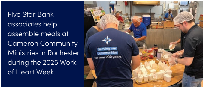
Five Star Bank associates help assemble meals at Cameron Community Ministries in Rochester during the 2025 Work of Heart Week.

The mission of the First Genesis Development Corporation is to assist underprivileged members of the Greater Rochester Community through programs designed to support employment, affordable and sustainable housing, healthy lifestyles, education and economic empowerment. Five Star Bank was proud to provide grant funding to support prospective and recent homebuyers through homeownership education. The homeownership program is part of a multi-year initiative that is designed to improve housing and economic conditions in the Crescent Area of Rochester.