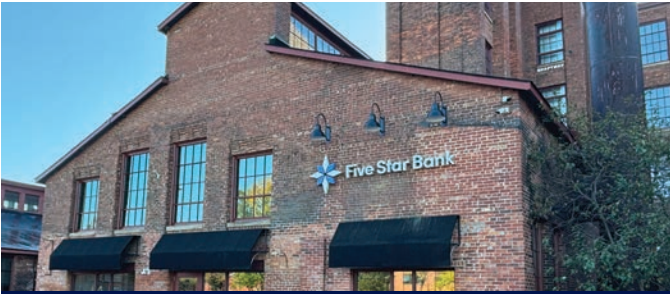
Five Star Bank’s loan production office in Syracuse.