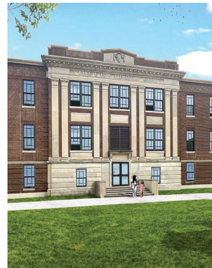
We are providing $20.6 million in financing to Providence Housing Development Corp. for Dana Lyon Apartments in Bath, NY.

In addition, in the last four years, Five Star Bank has provided more than $153 million in funding for low-income and affordable housing, inclusive of approximately $109 million in financing and $44 million in low-income housing tax credit investments. In 2024 alone, we provided a total of $34.7 million in financing for two affordable housing developments, which included supportive housing units – Dana Lyon Apartments in Steuben County and Churchview Commons in Monroe County.